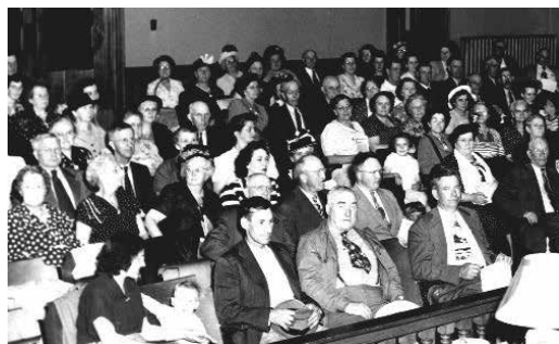
COURTHOUSE: The Sullivan County Courthouse in LaPorte is the site of early cooperative annual meetings.

The co-op contacted the Sullivan County Fair Association to see about partnering with them to hold the 2019 annual meeting in conjunction with the fair. Unfortunately, the fair schedule was set, and after extensive discussion and research, a decision was made to cancel the meeting in 2019.