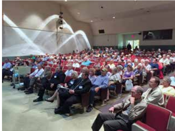
HIGH SCHOOL: Members met for many years at the Sullivan County High School Auditorium following the move from the courthouse. A fire at the school led to the 2019 annual meeting being canceled.

And so it was decided to hold the 2020 annual meeting in conjunction with the Sullivan County Fair on Sept. 3.